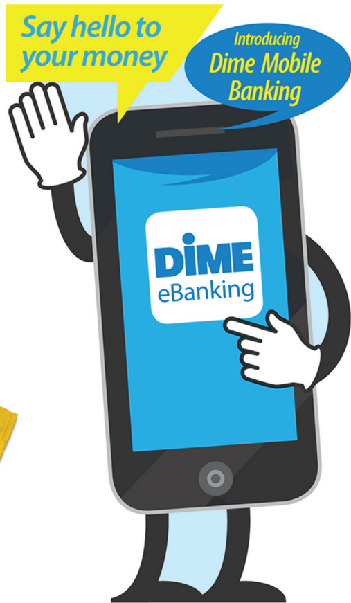
Free Standing Floor Display